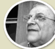
The bruising and swelling is dramatically reduced 36 hours after treatment.